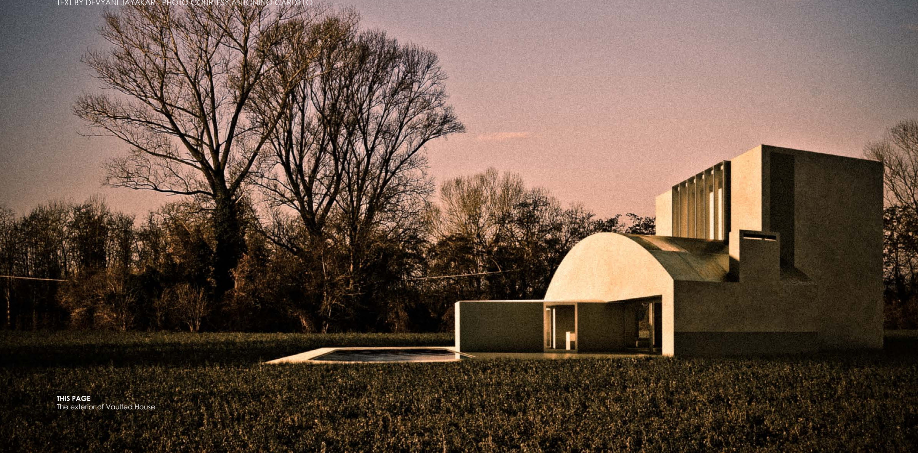
THIS PAGE The exterior of Vaulted House

TEXT BY DEVYANI JAYAKAR