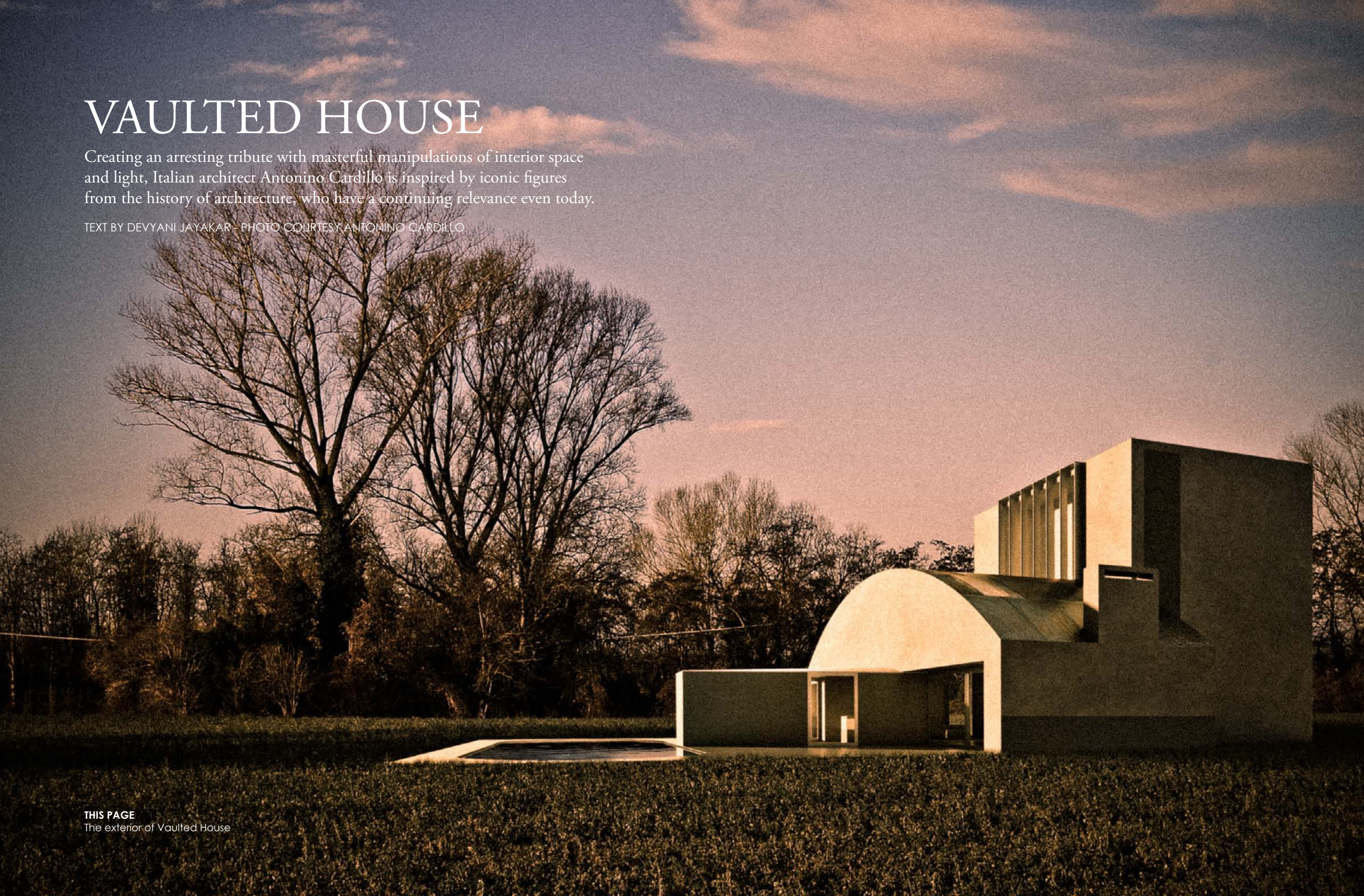
THIS PAGE The exterior of Vaulted House

TEXT BY DEVYANI JAYAKAR