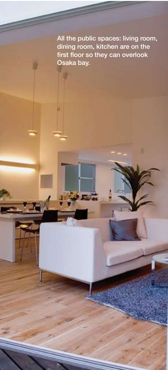
All the public spaces: living room, dining room, kitchen are on the first floor so they can overlook Osaka bay.