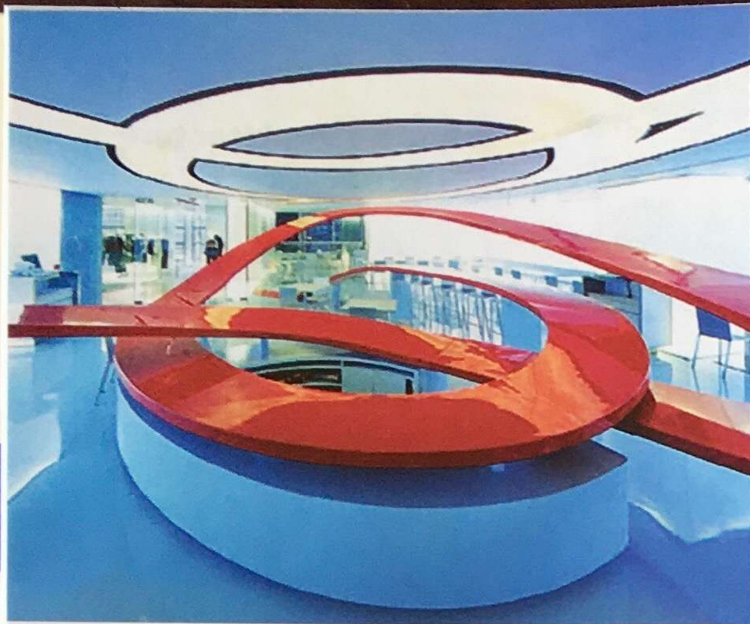
Emporio Armani by Massimiliano Fuksas Architetto