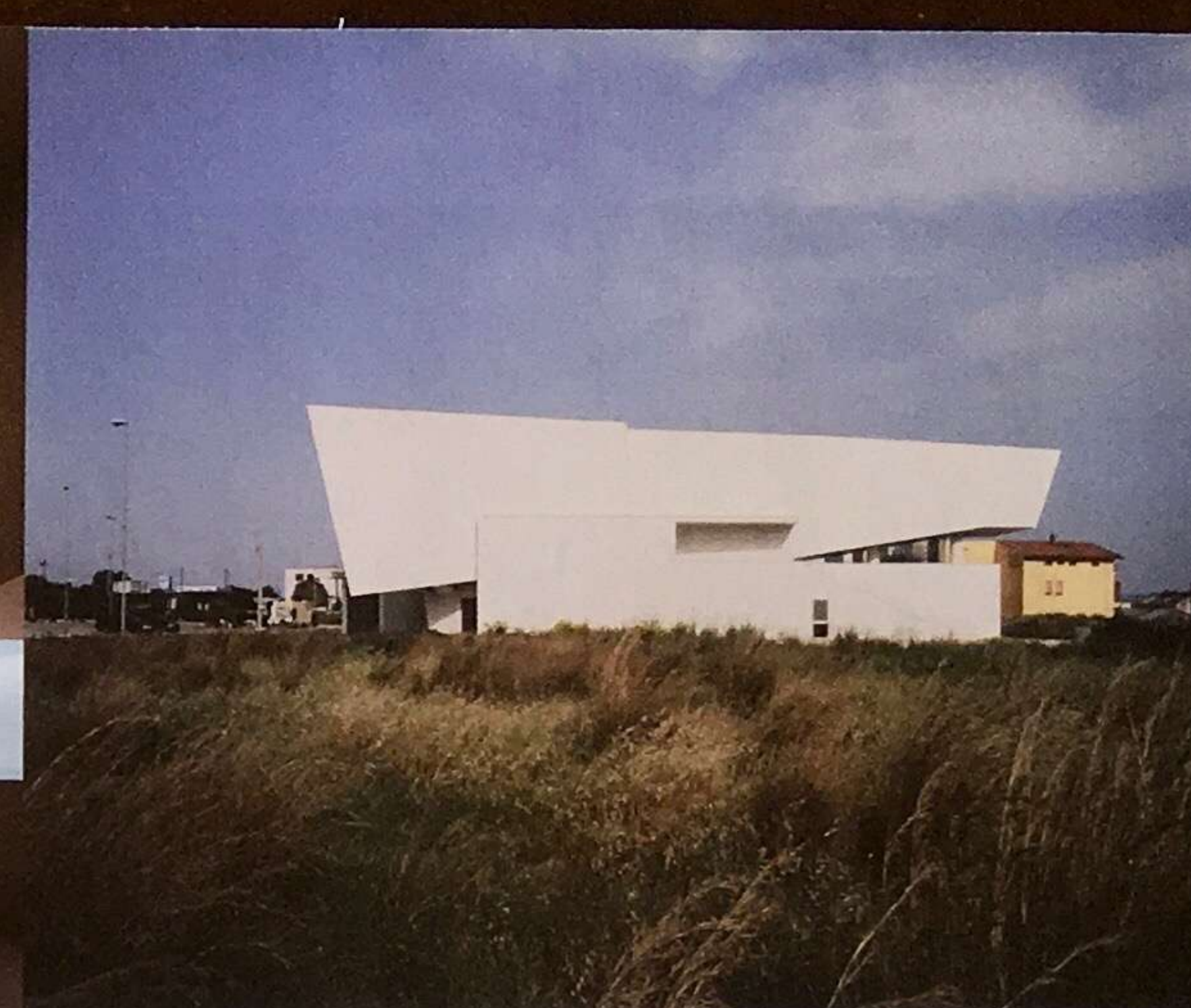
Services Center by Matrixassociati