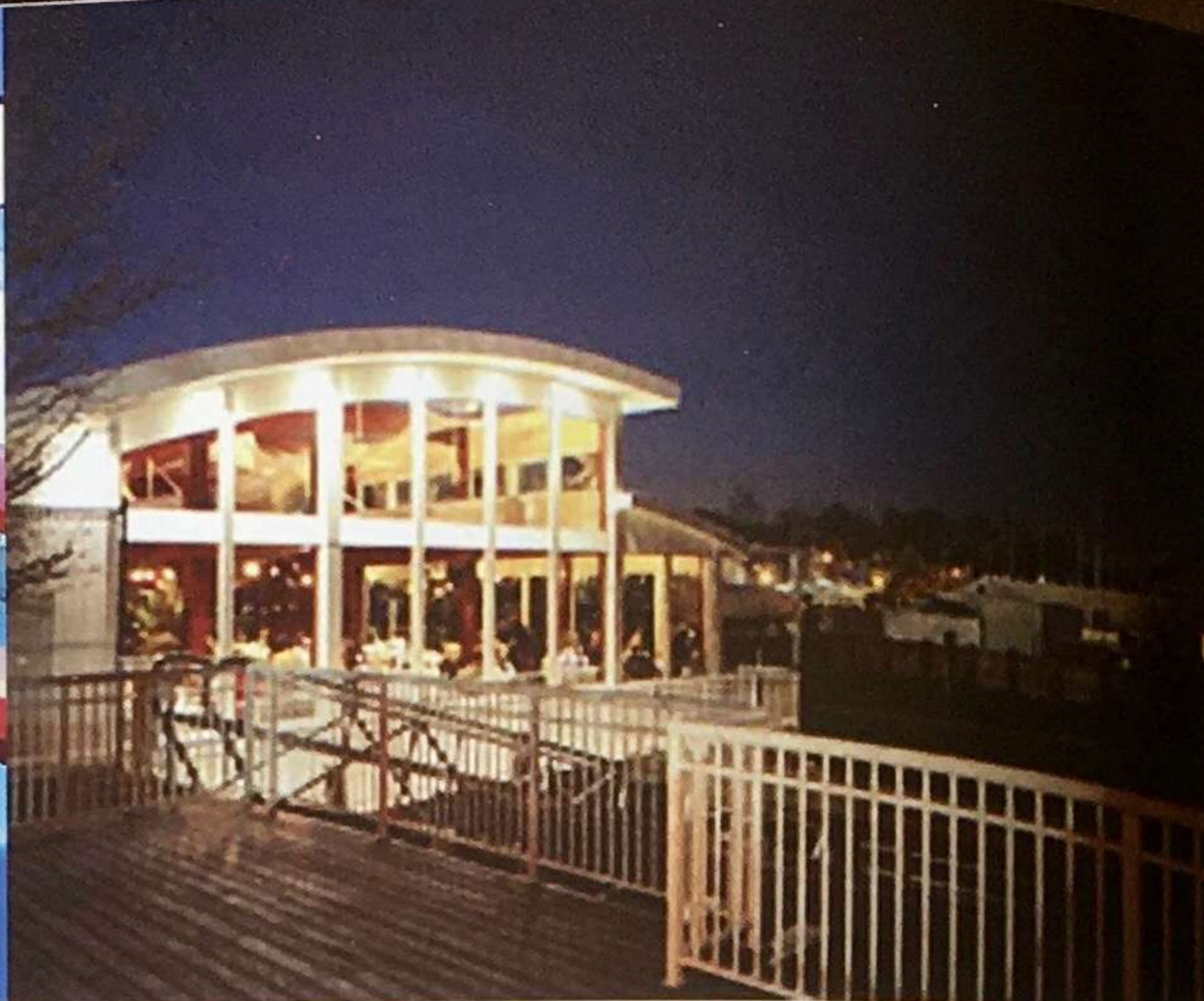
Marina Cafe by Salvadeo Associates Architects