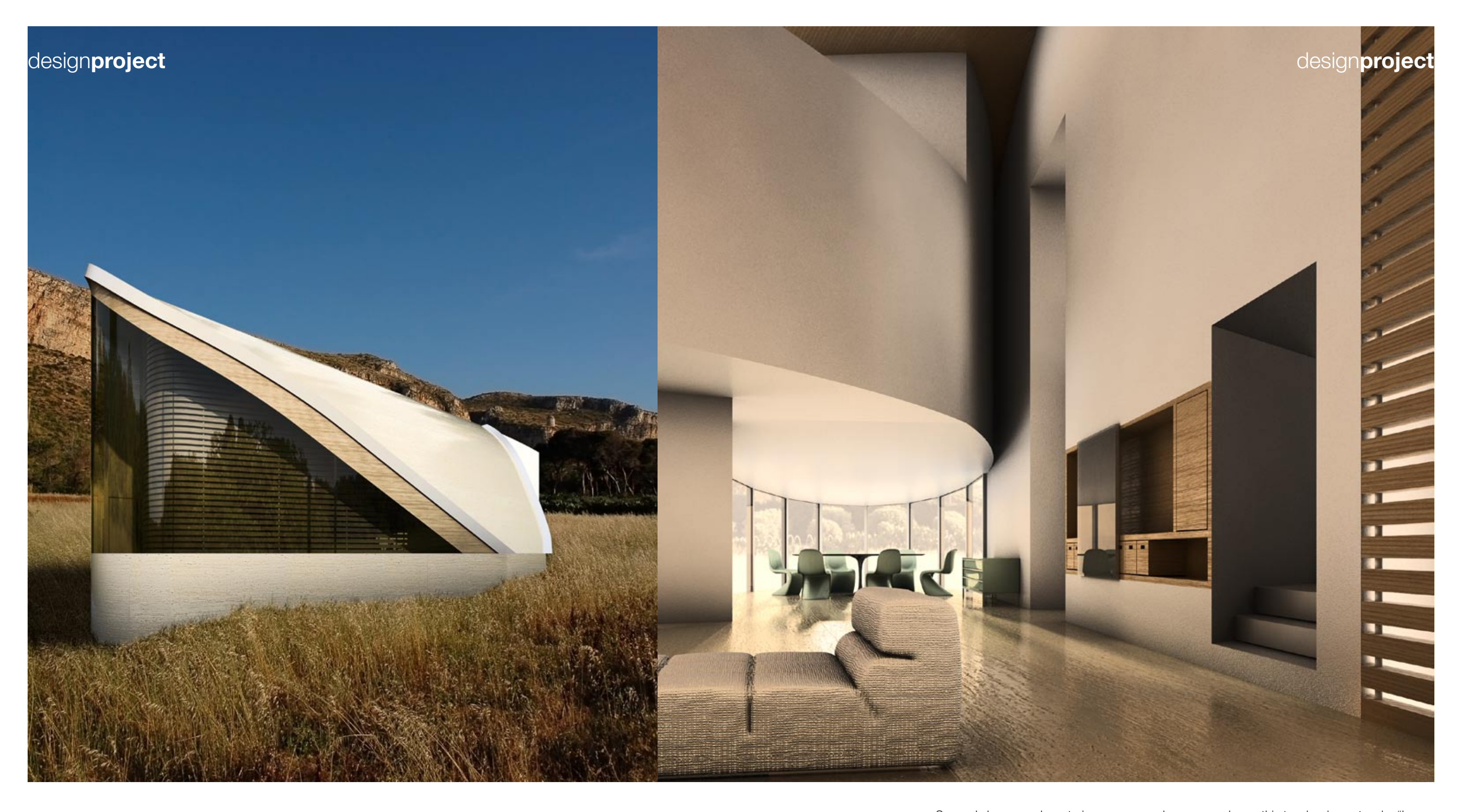
House of Convexities

Sensual shapes and mysterious curves and corners make up this two level spectacular "house of convexities" created by genius architect Antonino Cardillo set in Barcelona, Spain. Natural hues and earthy rhythms combine to present a voluptuously round and delicious atmosphere that provokes delight and awe where ever one's vision may fall.