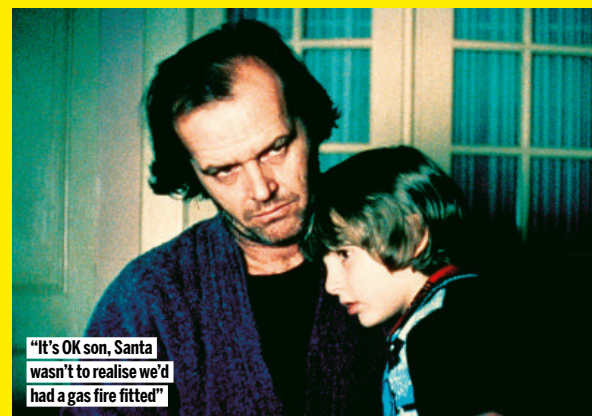
"It's OK son, Santa wasn't to realise we'd had a gas fire fitted"

However, it's far from done and dusted. King is not fully convinced by the prospect – but, with the box office-busting film that would surely follow, it could boost his retirement fund.