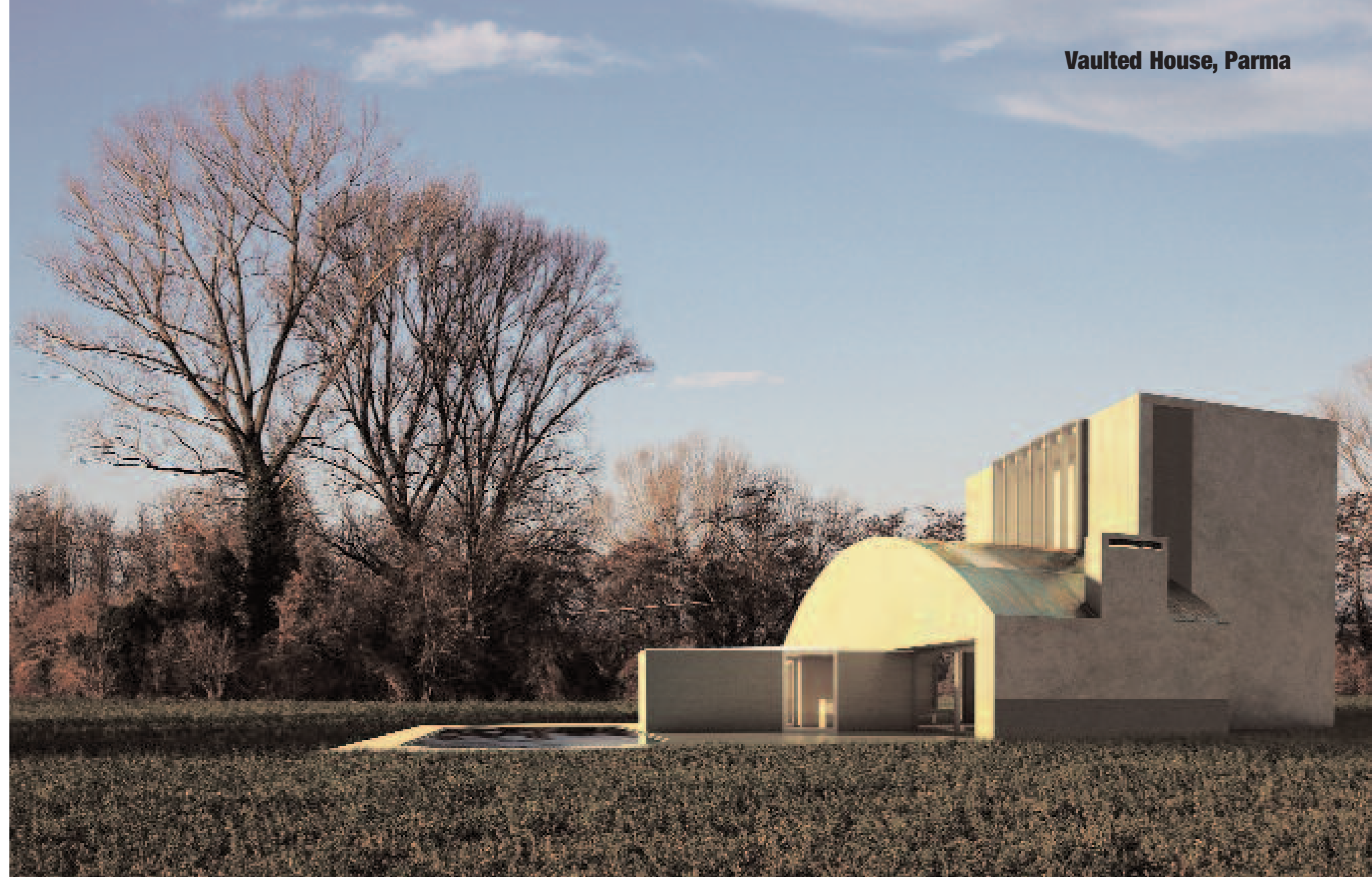
Vaulted House, Parma