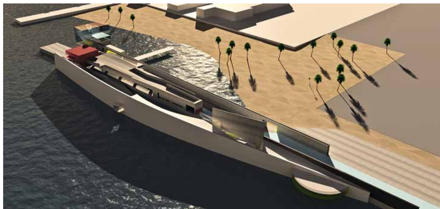
Echoes, entertainment centre for Trapani, Italy, design 2001 (above)