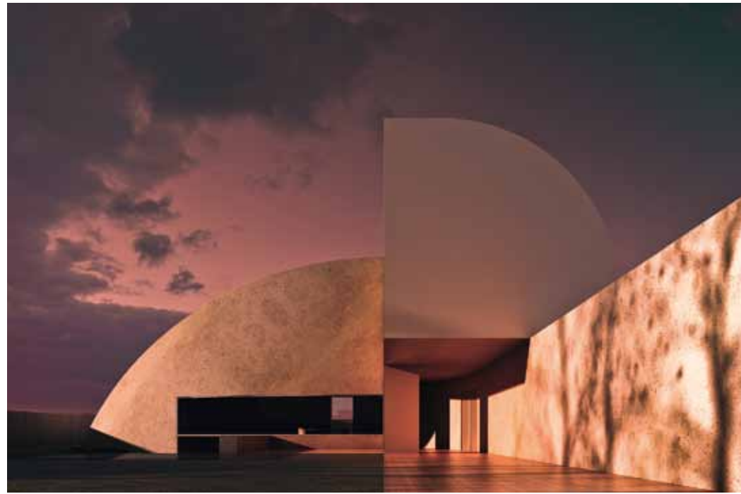
Concrete Moon House, Melbourne, Australia, 2009 (l.)