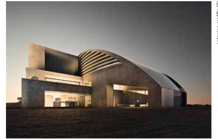
antonino cardillo (3)