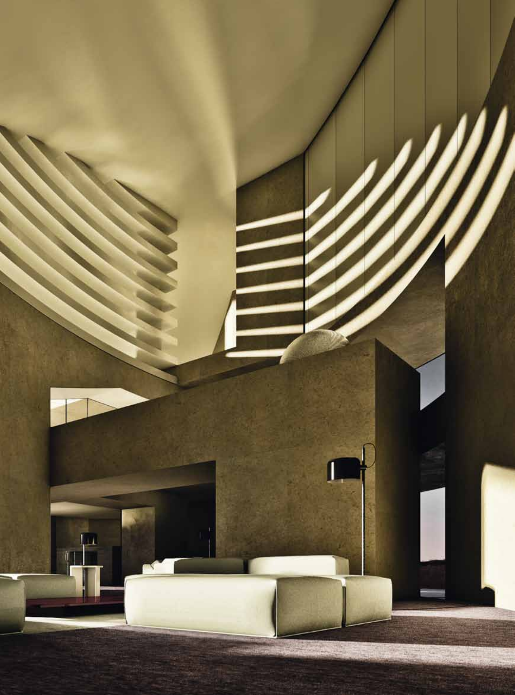
Purple House, Pembrokeshire, Wales, 2011