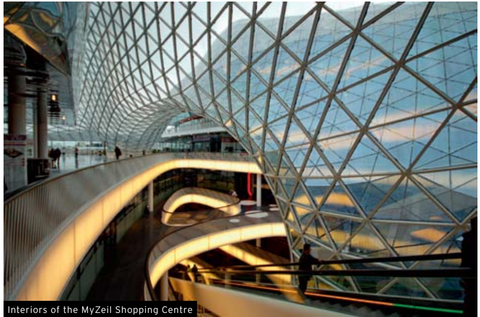
Interiors of the MyZeil Shopping Centre

For Fuksas, architecture is an act of criticism of reality, but he fails to see that it acquires sense and effectiveness from being in continuity with history. His recent works seem to live in a state of ingenuous isolation from time and space, prisoner of an axiomatic future. And this neo-futurist