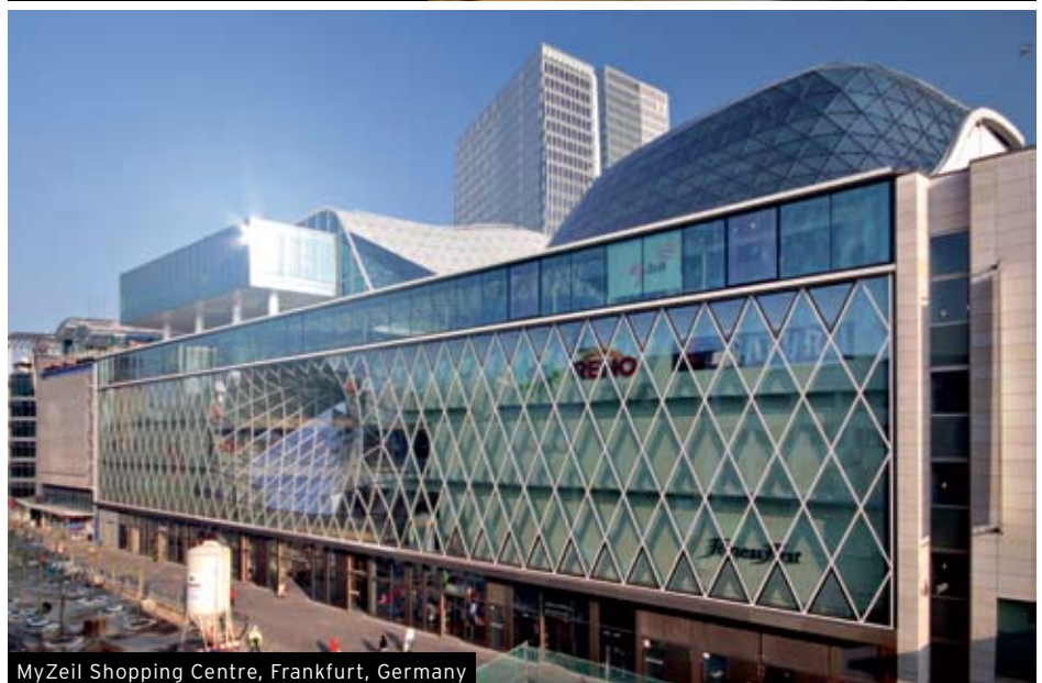
MyZeil Shopping Centre, Frankfurt, Germany

drift—which unfortunately encompasses much contemporary architecture – renders his actions abstract and homologous, cleaned of any possible geographical or temporal contamination, anti-historical, therefore... architecture for nowhere. He often declares that he works outside any avant-garde or utopia. But when with totalitarian virulence he states that "In architecture one acts always for the future, a little for the present, and never for the past. Looking to the past, re-elaborating it, revisiting it, is pure folly," he reveals paradoxically his dogmatic nature, that of a demiurge of the twentieth century.