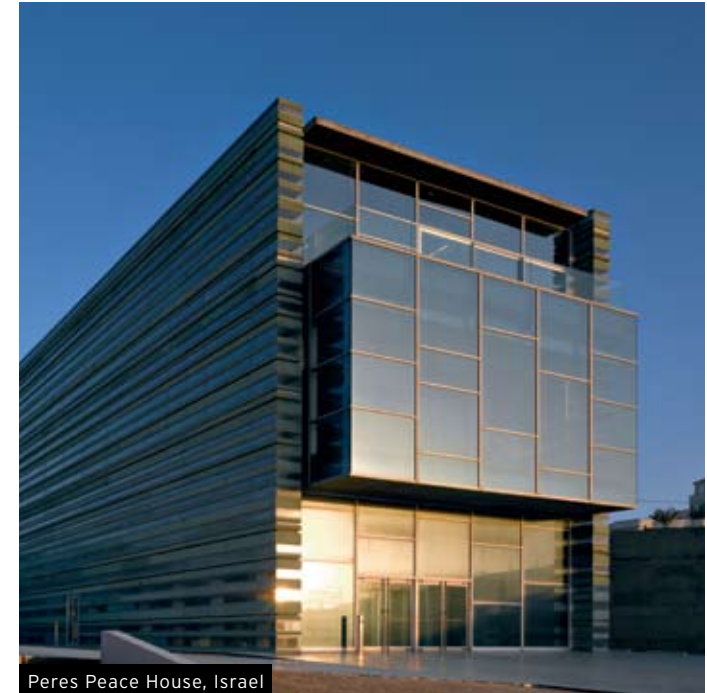
Peres Peace House, Israel

About his method of working in architecture, Fuksas says, "I adapt to what I find; like the Dadaists. But also like