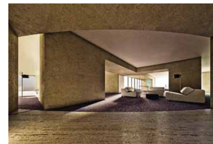
Purple House, Pembrokeshire, Wales, 2011

How do you judge, in this sense, the growing number of “iconographic” buildings, which also means the growing demand for individuality in architecture in general and for rather spectacular, expressive buildings in particular?